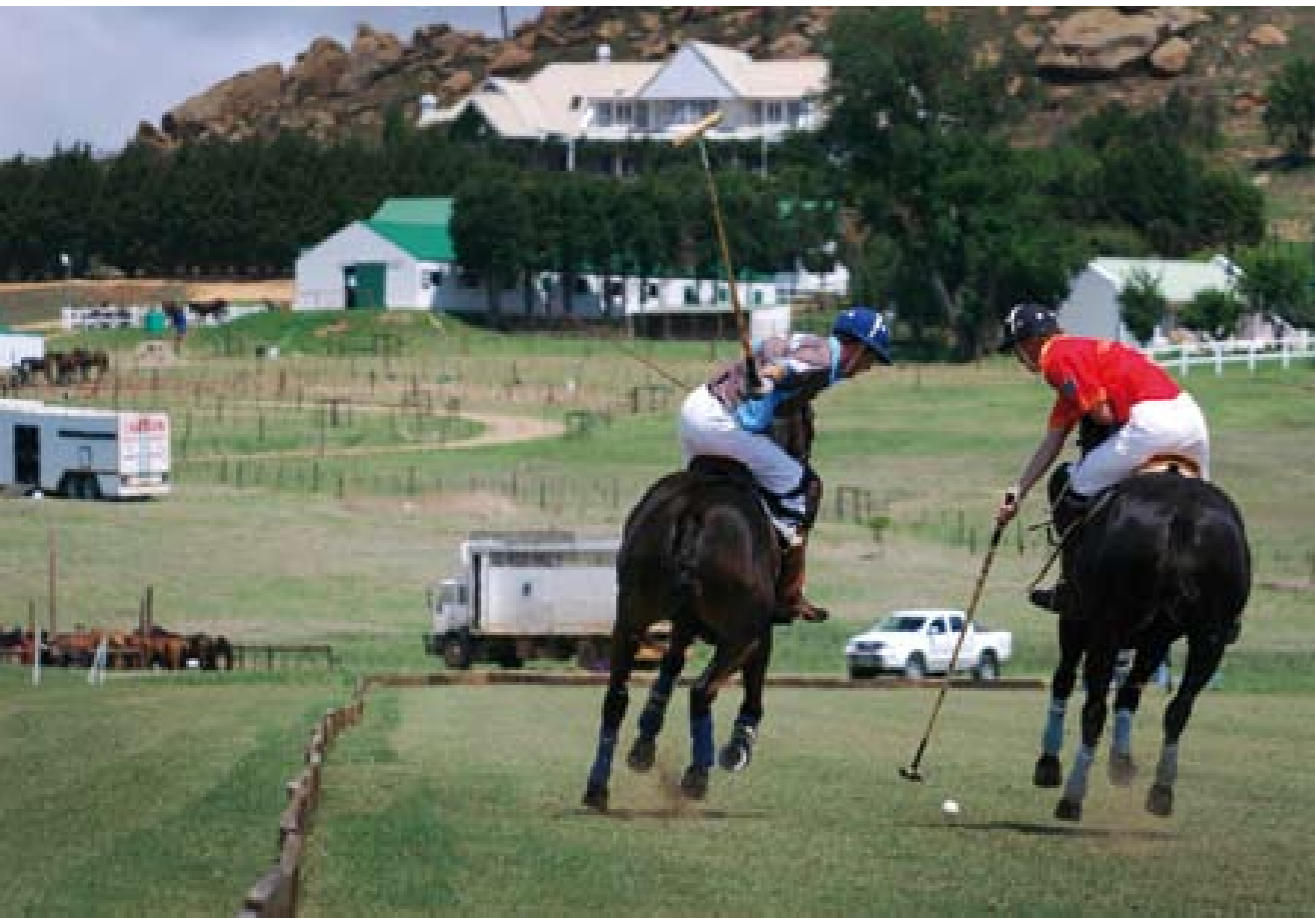
top ??? bottom ???